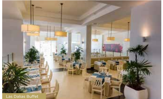
Las Dalias Buffet