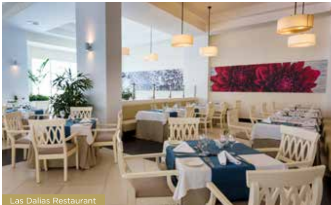
Las Dalias Restaurant