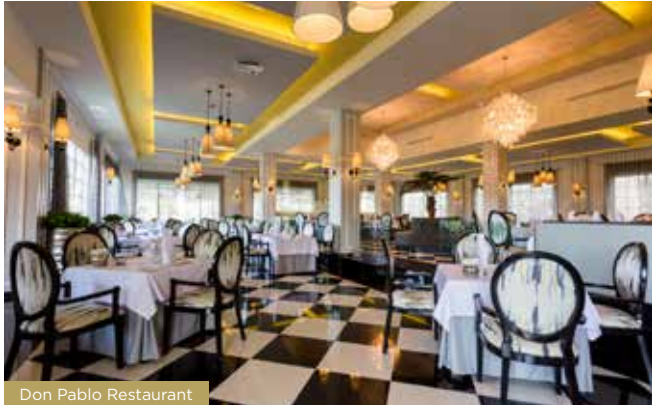
Don Pablo Restaurant